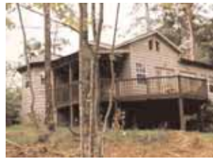
One of The Last Resort's deluxe mountain cabins.

We recommend The Last Resort to anyone looking to take their dogs and get away for a while (but not too far away). You can find out more at their website: www.thelastresort.com