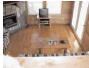
The sitting area in Chiracahua. The door leads to a deck.